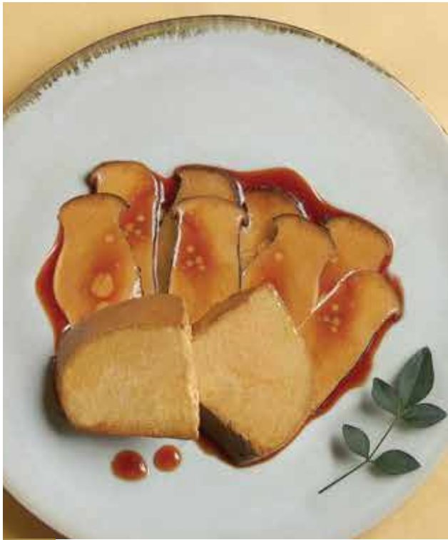
18 卤水鹅肝拼鲜菌 Braised Foie Gras with Abalone Mushroom $34