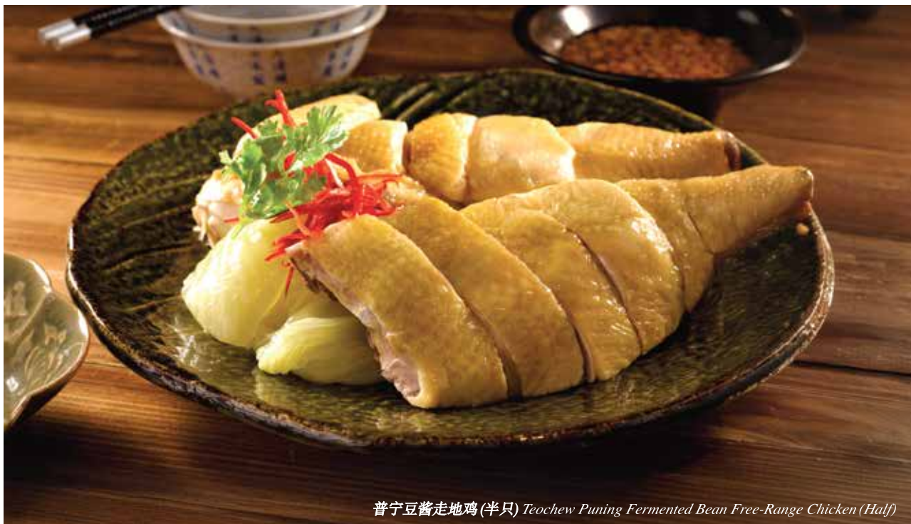
普宁豆酱走地鸡 (半只) Teochew Puning Fermented Bean Free-Range Chicken (Half)