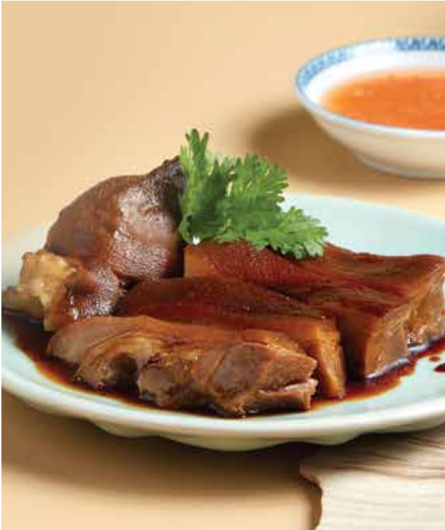
17 卤水猪手 Braised Pork Trotter $24