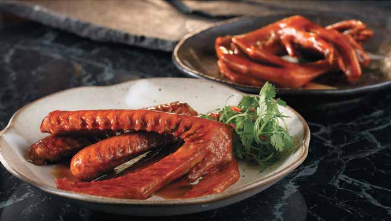
19 卤水鹅翼 Braised Goose Wings $16